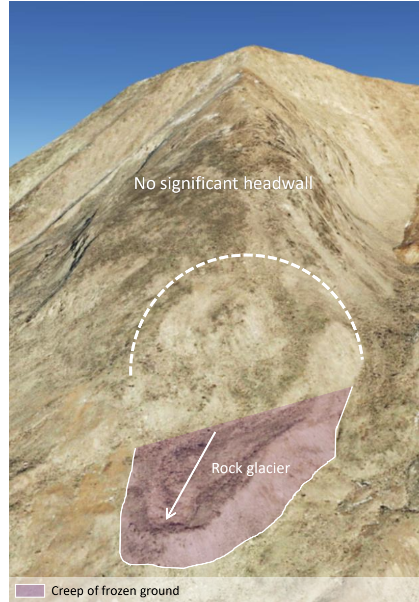
Creep of frozen ground

Gugla-Grüngarten, Switzerland 46.1266°N, 7.8218°E 2800-2900 m.a.s.l.